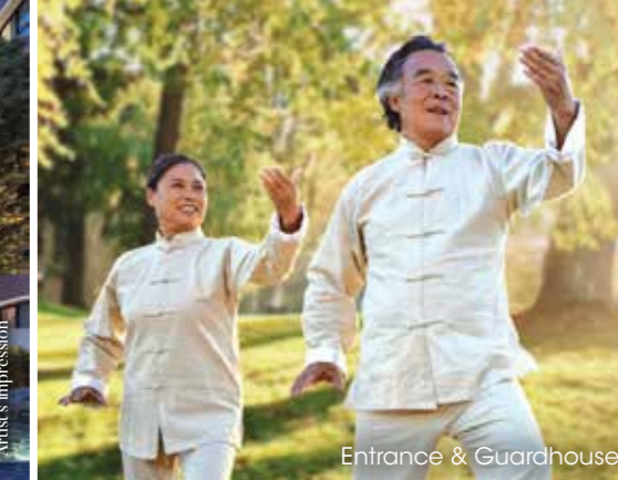
Entrance & Guardhouse