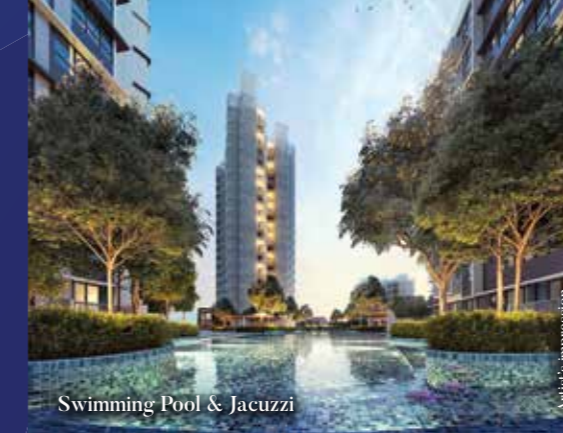
Swimming Pool & Jacuzzi

Empowering independent living with technology.