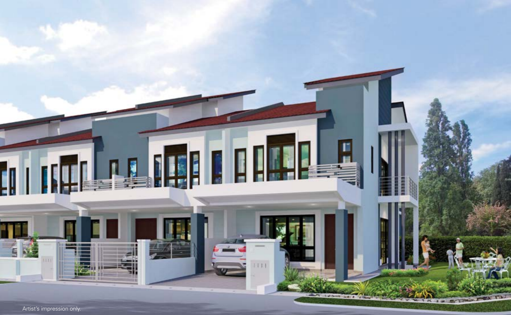
Artist's impression only.